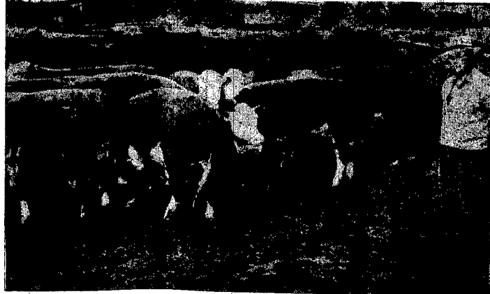
One of the many loads of fat steers shipped to the Sioux City Stockyards last week is shown above in a commission firm alley at the yards. The cattle belonged to Emil C. Muller, Wakefield, Neb., showing right above and sold July 14 for $32.50 per hundred weight. There were 18 steers weighing 1201 pounds at this price with two head scaling 1112 pounds at $30.00.